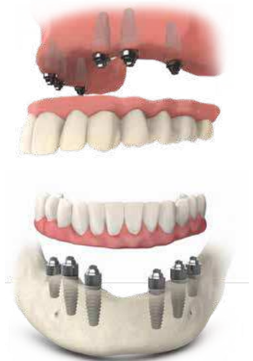
Teeth on Implants

A Dental Implant is a screw that is placed into the bone in your jaw that acts like a root of a tooth. It is the anchor that a Porcelain Crown is then placed upon. Teeth are securely fixed to your Dental Implant, and only your Dentist can remove your teeth for cleaning, repair or replacement. The Dental Implant is the foundation, the part you do not see.