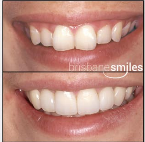
Mild Teeth Crowding with worn teeth was corrected with Eight Emax™ Porcelain Veneers.