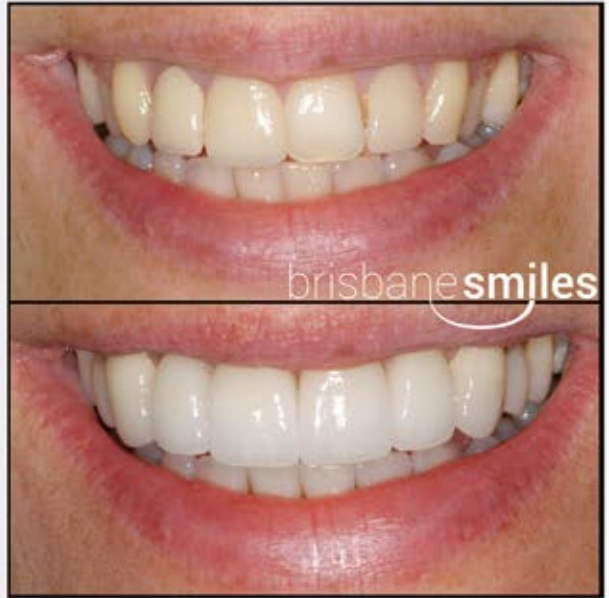
Mild Teeth Discolouration was corrected with Six Emax™ Porcelain Veneers. The Lower Teeth were whitened with Zoom™ Teeth Whitening