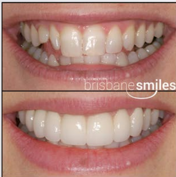
Dis-proportionate Teeth Shapes with uneven and small presentation was corrected with Six Emax™ Porcelain Veneers.