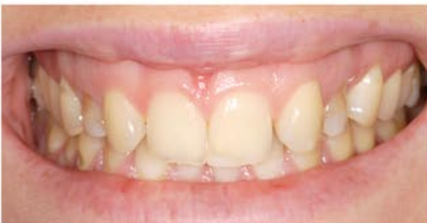
Before Cosmetic Dentistry