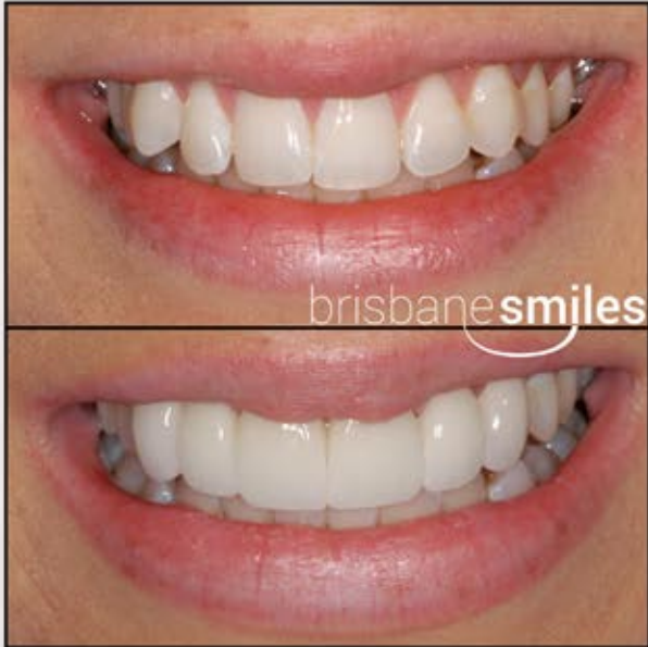
Mild Teeth Crowding was corrected with Six Emax™ Porcelain Veneers