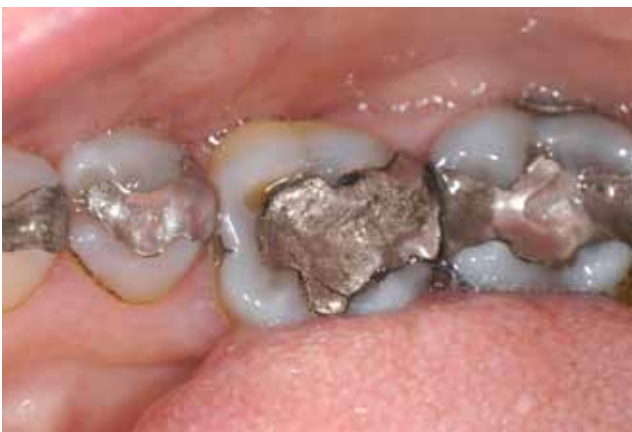
Old Amalgam Fillings